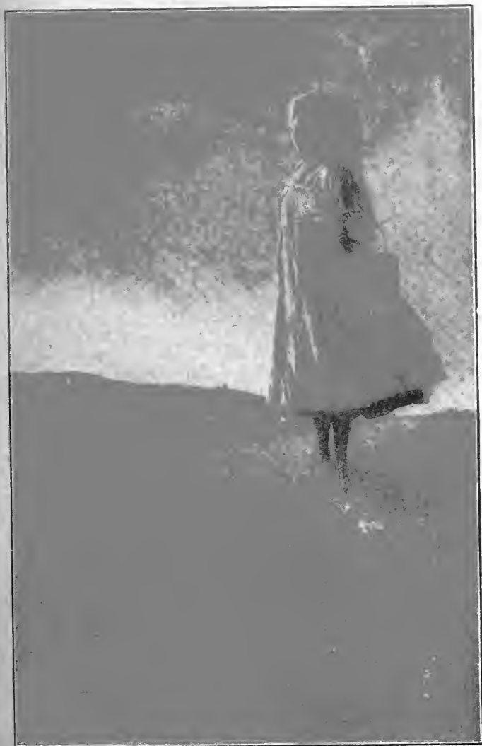
A Little Girl in Gingham